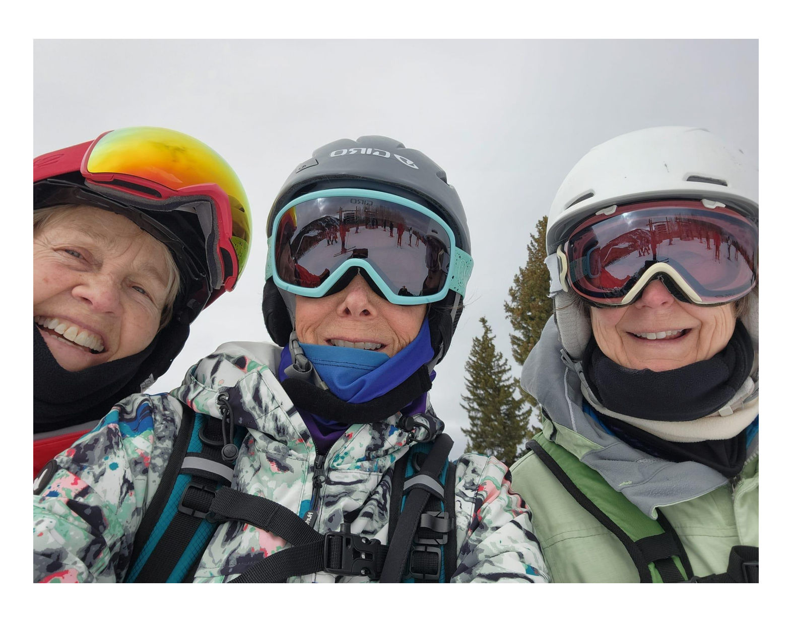
Ski buddies are the best buddies!