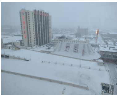
We woke up to less nasty weather.