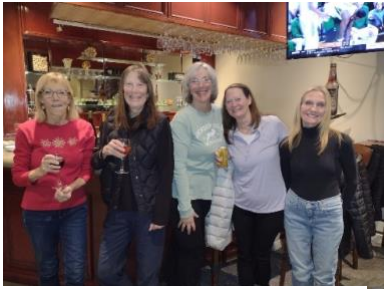
It was nice to see everyone after their first day on the slopes.

Later that night, the resort had a wine and cheese