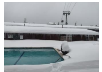
Anyone fancy a swim? You better watch your step!

Once we got to our hotel, you could see how much snow had fallen and that staff was just trying to dig out driveways and sidewalks.