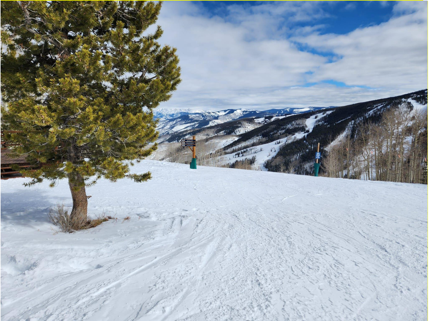
Beautiful day of skiing! Reported by L. Ferenc