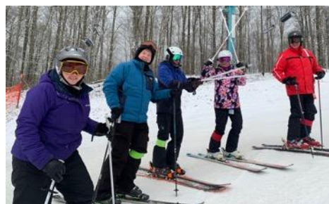
Pole fight on Mardis Gras!

The bus arrived early, so we loaded up and pulled out on time. About an hour and a half into the trip, a light breakfast was served consisting of mandarin oranges, hard boiled eggs, a French pastry and juice.