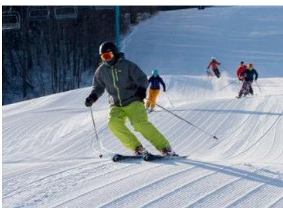
Groomers took care of the ice

Holiday Valley 2 - After a day of rain and several participant cancellations, our group of 19 LSC skiers joined 25 others from SSC (which led this trip), passing three cars in the ditch before the east side pickup, followed by a snowy, but thankfully uneventful, drive to Holiday Valley. After a bus breakfast of bagels or muffins and 100% not-just-orange juice, and with great anticipation, we arrived at 10:30. Although the “big storm” had added only about an inch of new snow to the slopes, the groomers had taken care of most of the expected icy conditions, so we had better than expected skiing.