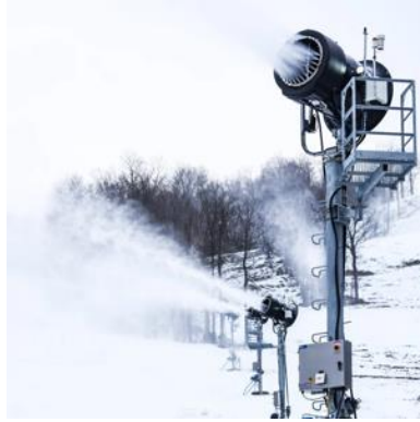
Snow-making was in full force!

Cindy’s Run was another adventure, since half-way down the run our goggles were covered with ice from the snow machines.