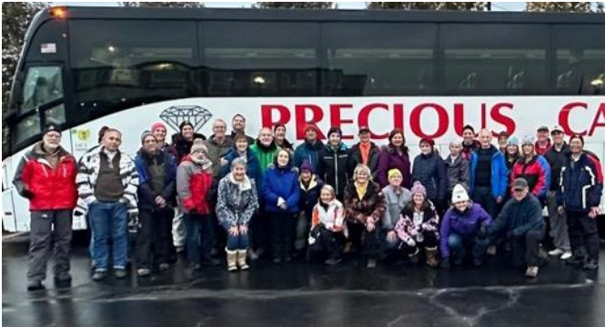
Thirty- four skiers from both clubs