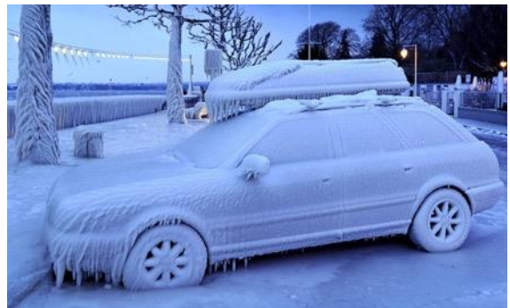
(It wasn’t really that bad, but you get the picture)

After dinner in town and a quiet ride home, we arrived back at our cars where we made good use of our ice scrapers, as the car windows looked like they had made several trips down Cindy’s Run.