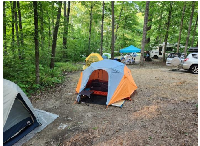
Nicely shaded campsites with lots of elbow room and electricity!

We look forward to having more campers join us next year!