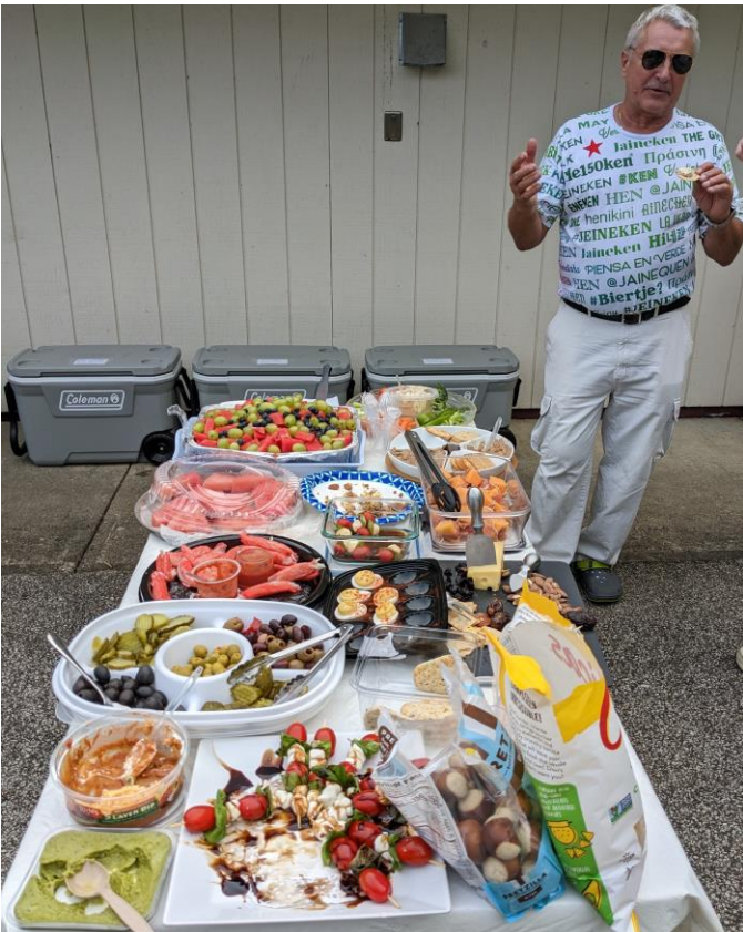
Awesome appetizer table!