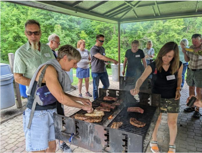
Cook your own chicken and steak – turns out just like you want it!