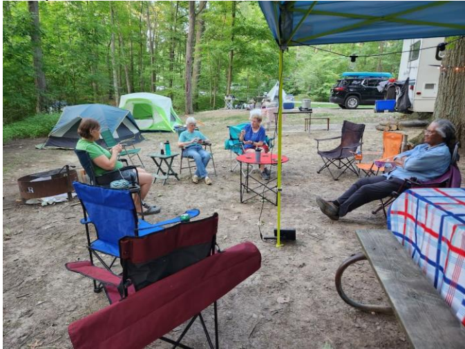
Campers enjoying snacks and stories after a fun day of kayaking.

August 4 thru 6 was our 6th annual Lewis Ski Club camping trip. We went again to West Branch State Park, and shared 3 connecting campsites.