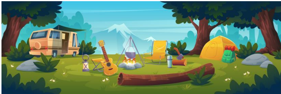
Mountains are not included

Reservations by July 6 are strongly suggested, as we will release unclaimed sites the next day.