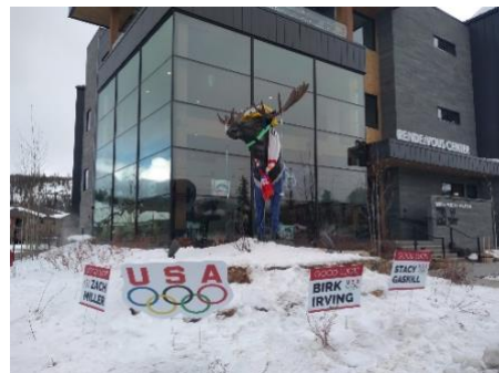
The Olympics were ongoing during our trip, Winter Park had several attendees, with Paralympics athletes also training there.