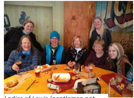
Ladies of Lewis (gentlemen not pictured, they were there too!)