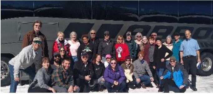
Group picture just before leaving for home, another bluebird day!

Thirty-two of us journeyed to the Colorado Rockies for a week at beautiful Winter Park Resort. Luckily, we had a direct flight from Cleveland to Denver, but we had to battle long check in and security lines at the airport. Fortunately, we all made it to Denver and got to make our regular grocery stop at King Sooper's off of I-70.