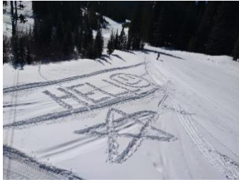
Someone was busy that morning under the lift.