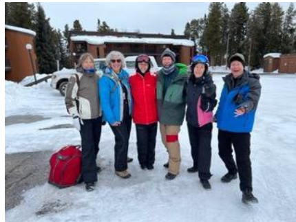
Waiting for the ski bus!