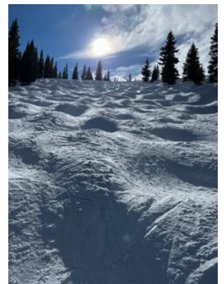
Keeping it bumpy.

Weather wise, you couldn't have asked for better conditions. Sunday-Tuesday were sunny, warm bluebird days. After a snow refill Wednesday (when many took off), it was mostly sunny Thursday and Friday. Winter Park, like most of Colorado, hasn't had the best snow year and it showed in a few busy areas, making navigation a bit tricky. Favorite areas of the mountain included an open groomer called Cranmer and the Parsenn Bowl, which is accessed by a lift that dumps you off at 12,000 feet above the treeline and has about 100 different ways down. Winter Park is a place for bumps lovers, with runs of all degrees of difficulty. Tree skiing is also in abundance, whether through tight, steep passages or wider, more mellow areas.