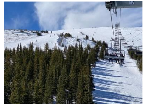
Lift to Parsenn Bowl above the treeline, wind is always an issue up there at 12,000 feet.