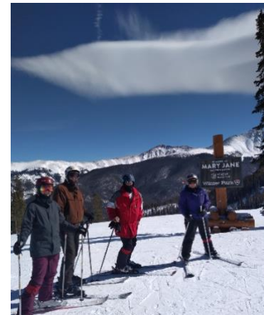
Mary Jane is one of Winter Park's most famous areas, hope you like bumps (and weird clouds).