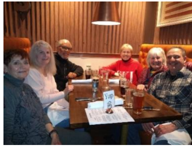
Midweek party fun.