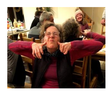
All great trips must come to an end...