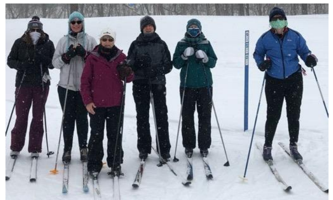
Group at Big Met Golf Course

Our final outing was Saturday, February 20th at Big Met in Fairview Park.