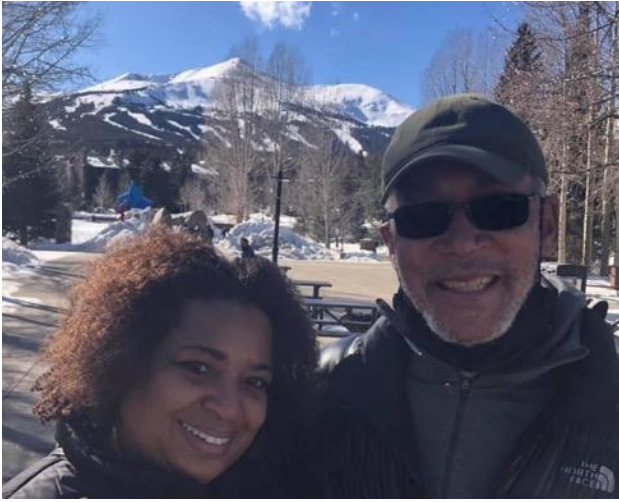
So happy to be here!