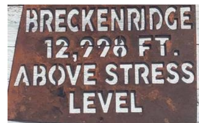
A great sign for 2021!

Yes, our club actually made it out to a major ski resort, proving that there is life during this pandemic. Below are a few of the pics, but go to the club's Facebook page to see all of them.