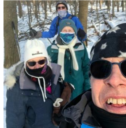
Group at Chapin Forest

The second was on Saturday, February 6th at Chapin Forest in Kirkland.