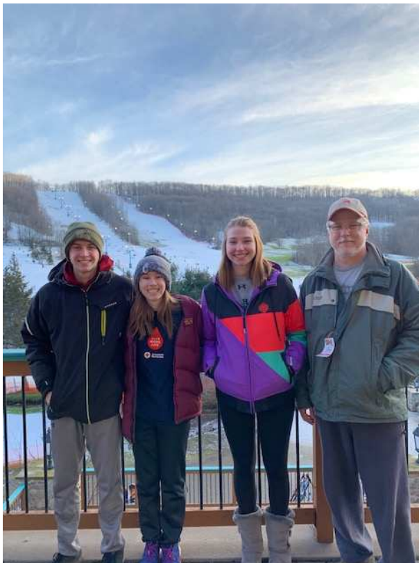
Some Youth (the 3 on the left)!