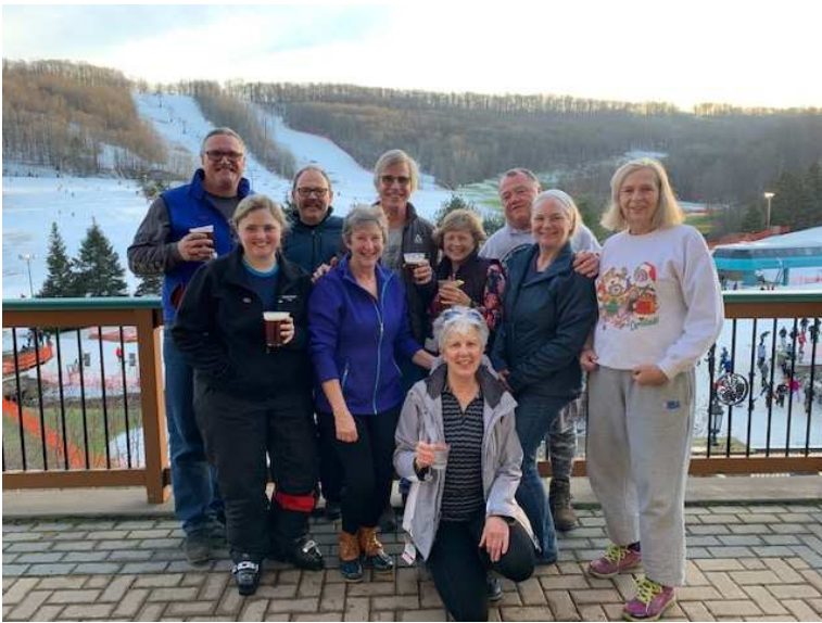
Happy Apres Ski Group!