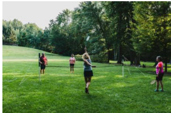
BADMINTON 4, AUGUST 14