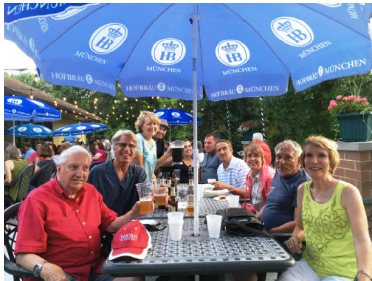
Members enjoying the festivities at Donauschwaben's Beer and Brats on July 20th