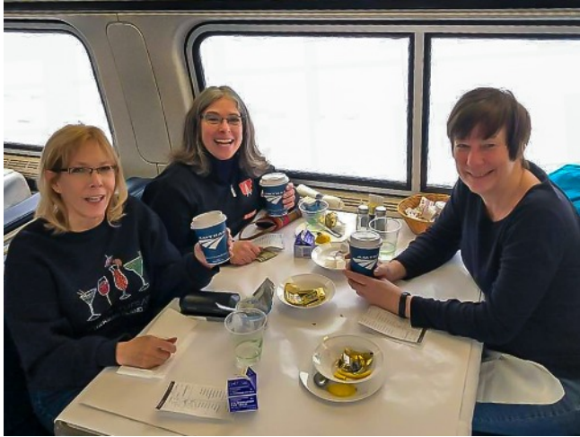
On the train