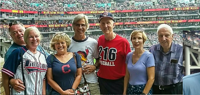
@ The Ball Park