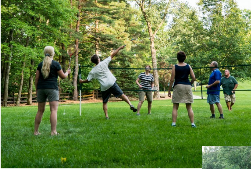
@ Bad To The Bone Badminton II