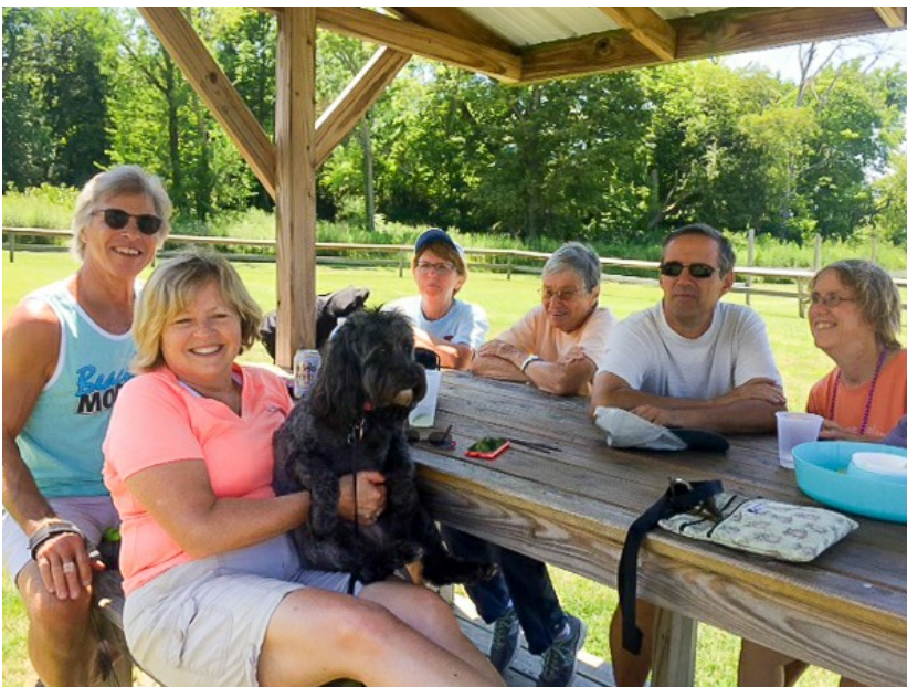
@ Kelly's Island