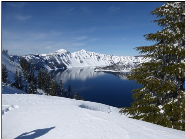
Some took a side trip to Crater Lake NP and were greeted with sunshine and blue waters.

Thank you for the generous gifts, I am still wearing the jacket and the smile! I so much appreciated your thoughtfulness! I want to go back, will you join us next time? -Kim