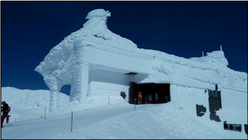
Club members spent the month on ski journeys, whether on day trips or trips to either Vermont or Oregon. Read more about the Mt. Snow trip on page. Pictured is a snow-crusted lodge at Mt. Bachelor, Oregon.