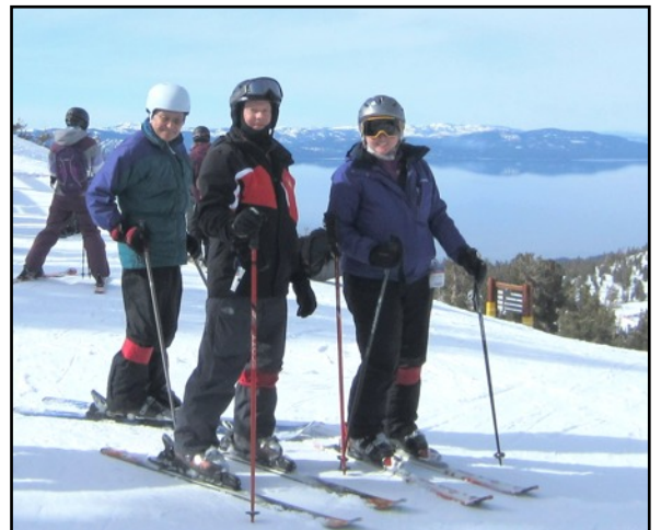
Some red leg bands were spotted in the wild at Heavenly last season.