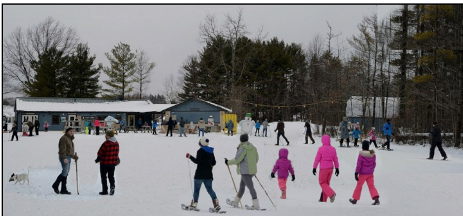
Club members are having an outing at Chapin Forest Jan. 21.

More can be added if requested – let me know if you'd like to go somewhere and you want me to let others know to join you!