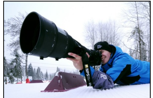
While this is some nice glass, you don't need this to take nice shots.

Finally, after I've babbled for 20 minutes, I will open it up for the more accomplished ski photogs in our membership to share best ski photo practices.