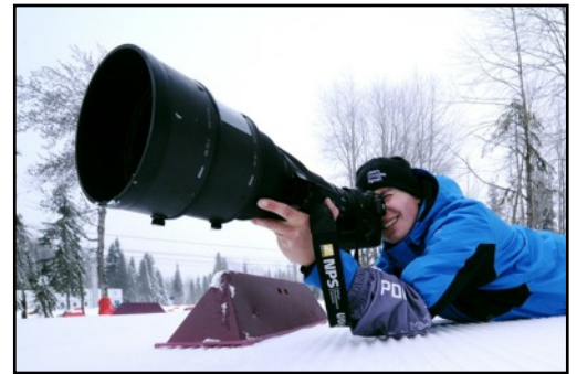
While this is some nice glass, you don't need this to take nice shots.