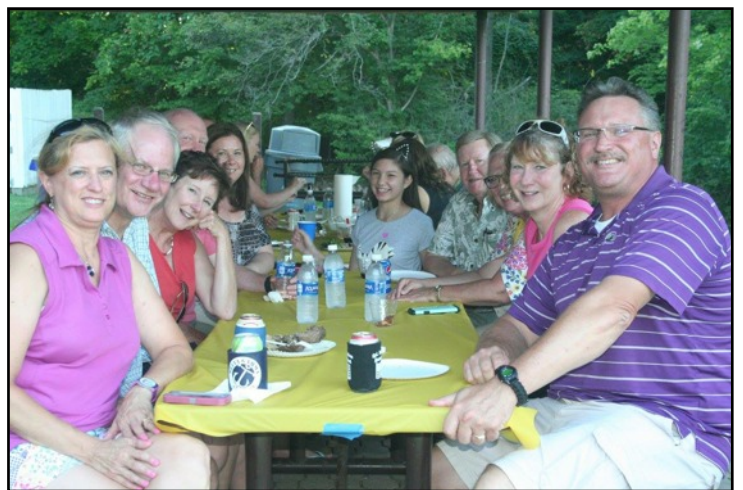
Members enjoyed the club's annual picnic Aug. 2.