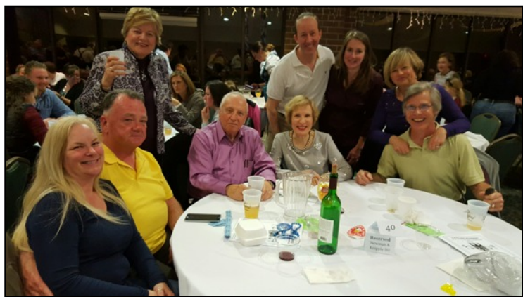
With the snow melted, club members kept busy with a trip to Musikfest at Donauschwaben, where we hold our club meetings. For more information on upcoming activities, go to page 7.

Next meeting Our next meeting is Tuesday, April 5. This month, we will be approving changes to the club's constitution and electing new officers. Go to https://lewisskiclub.org/ for more info. We meet downstairs at 6 p.m. at Donauschwaben Club, 7370 Columbia Road, Olmsted Twp. Come early starting at 5 p.m. for a drink at the bar or some conversation upstairs if you like.