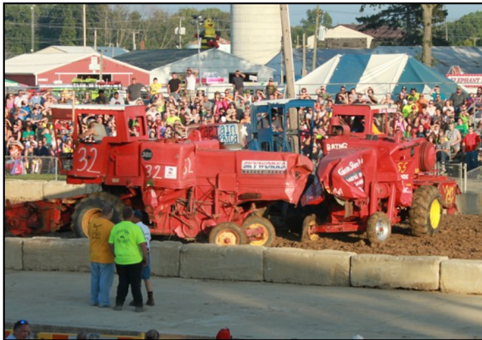
A group of members went to check out the annual Combine Derby at the Lorain County Fair. A write-up and some more photos are on page 5.