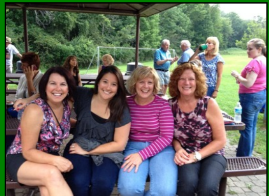
Fun times at the picnic!