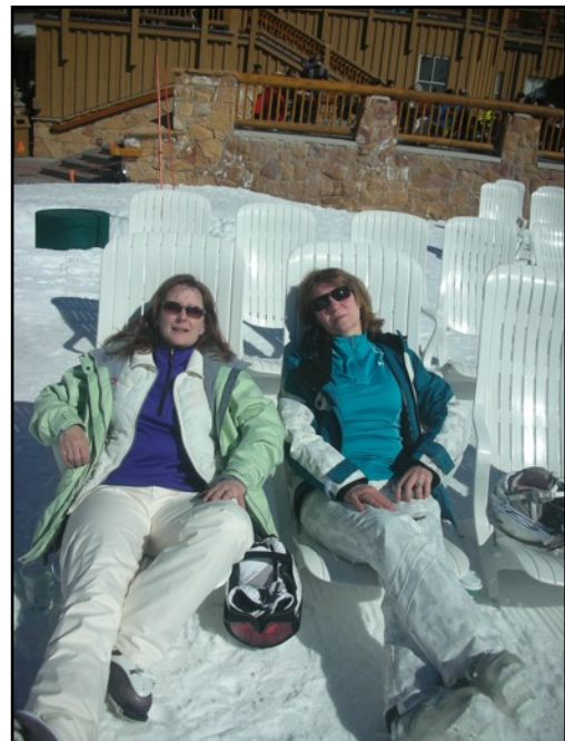
Our two first-class ladies catching some rays off the slopes.