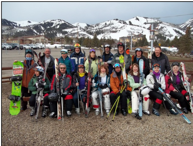
Some of the group in front of the Canyons.

We arrived Saturday at the Yarrow Hotel early enough for everyone to settle in, shop a little, even rent skis for the week. By the evening everyone was at the welcome party enjoying drinks, pizza, veggies, satay chicken and Swedish meatballs. There was a small snag arriving in SLC when some people did not receive their luggage but everything was delivered by the evening and everyone was able to enjoy their first day on the slopes.