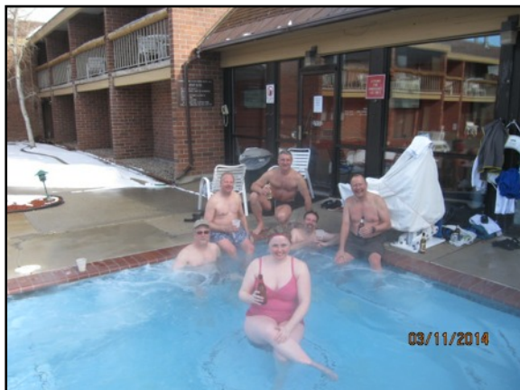
Hot tubbing it up.

Sunday morning, after our included breakfast, we were off for our first day of skiing at Park City Mountain Resort. Probably our warmest day of the week, which meant each ski day only got better!