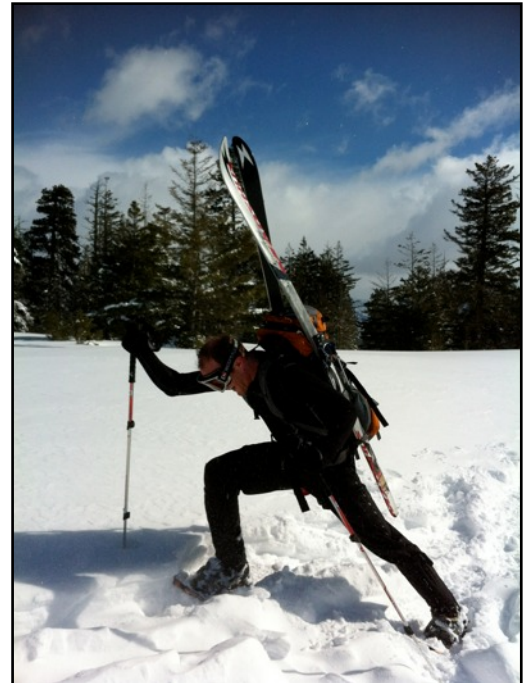
Working hard on the flats...

For those of you who long for the Spring weather, it finally appears to be here. Me? I'm already tired of those outside chores and the spring peepers and gobblers are again keeping me awake at night. No, I'm not complaining, I enjoy the weather and the sound of the peepers, but I just need sleep. Oh, how I miss the snow season. I'm already looking forward to the next ski season and your ski club representatives are also very hard at work getting ready for next years ski season. Keep a careful eye on your email to find out all the details on next year's extended trips. The current plans appear to have something for everyone.