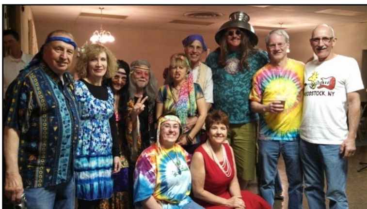
Club members gathered April 27 for the CMSC race banquet in their best hippie outfits. The theme was Woodstock Revisited. Along with having dinner and listening to a live band, awards for the season were given out.