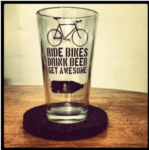
Along with the club picnic (see page 4) there are also other fun summer activities to get involved in this month. See pages 5-6 for more information. (They involve cycling and beer it seems ...)