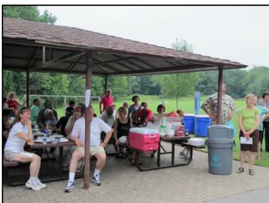
Members ate in the pavilion and in the shelter inside.