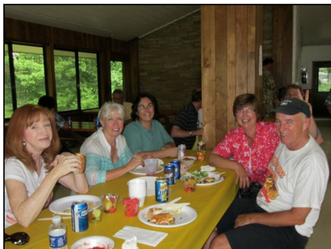
Everyone got to eat a good meal of burgers, pork and hot dogs.