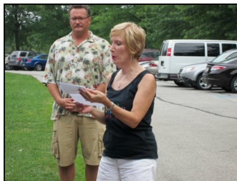
In memory of Annie Easley, a friend of hers wrote a letter describing her opinion of heaven...God is a she, but the wine list is lacking!