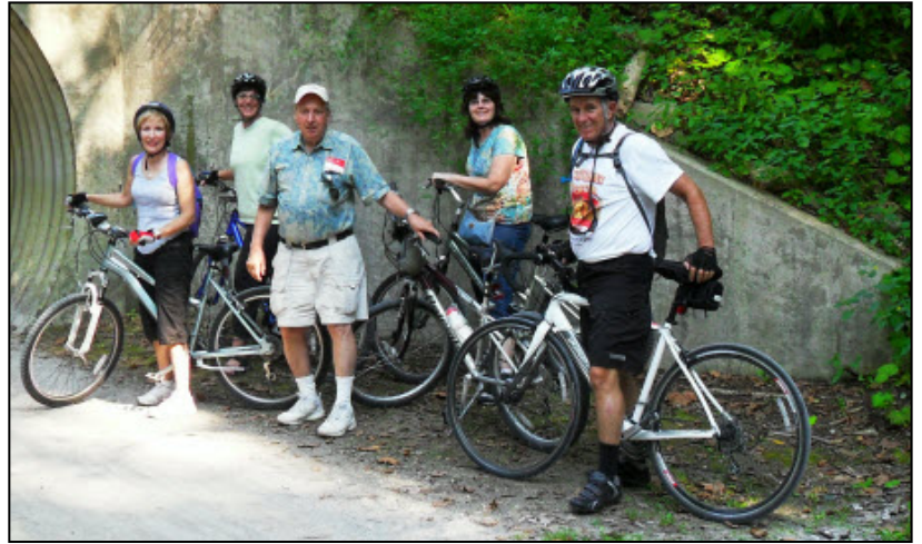
Members on their bikes in the CVNP.

As part of the new look to appeal to potential new members, we would like to invite members to submit a candidate picture for the club's main page. Members may submit up to two pictures for each of our two 'activity' seasons: one summer, one winter. A single photo will be elected from all the candidates for this year's main page. Images should capture what you believe the club is about. Please submit your pictures to the web curators by August 5th.