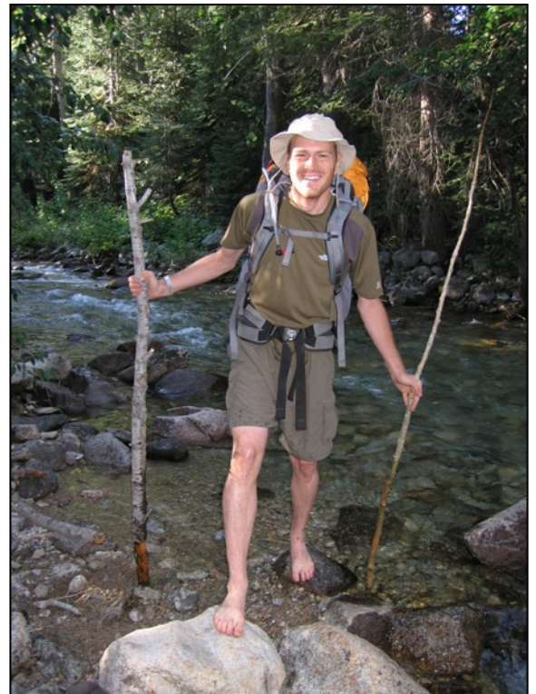
What happened to my shoes?

Throughout the rest of the summer and fall, your snowsport and social club has a variety of planned indoor and outdoor activities. Among the upcoming activities is the Tree-mont ArtWalk on Aug. 12th, and a Kelley's Island day trip on Aug 20th. The Kelley's island activity coincides with the Island's Homecoming activities, so you are guaranteed to find a wide variety of options to spend a fun-filled day.