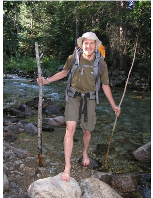
Waiting patiently for winter...

It's officially summer, yet by looking at the ski club activity planning, it's hard to tell if it is a snow-season or a non snow-season. This summer, ski club social activities continue to help you enjoy the summer weather. Hopefully you are taking advantage of these fun social activities. Look for activities from festivals to bike rides to pub nights. A number of events are either on the calendar or in the planning phases. Continue to watch the club web calendar this summer season for future activities.