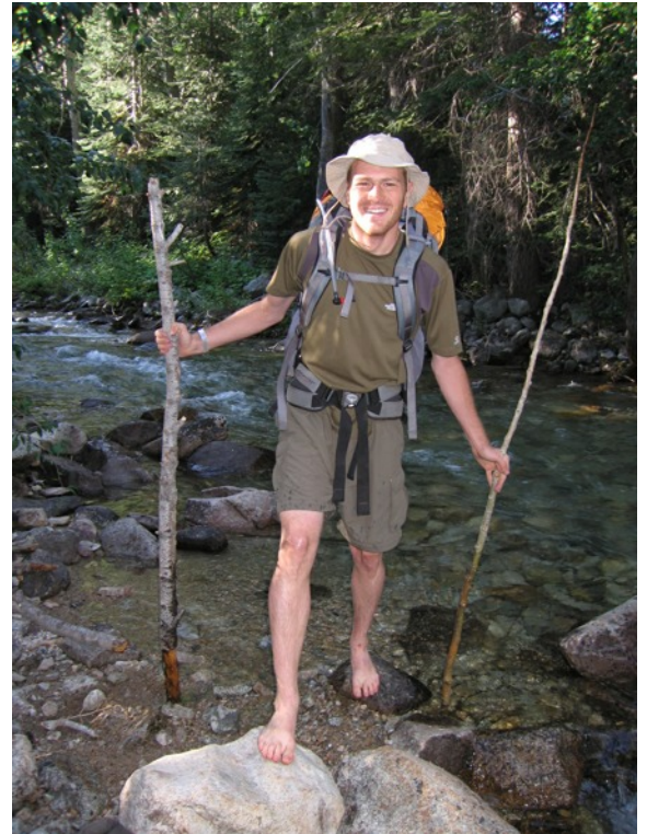
Hiking in Kings Canyon NP in California

Even though you may feel that the snow season is long behind us, the Lewis Ski Club trip planners have already started tuning their gear. They have been certainly hard at work planning the snow trips for the next big snow season. This year, your ski club is considering a number of options from the east coast to the west coast, so be sure to keep your eye on the newsletter and your e-mail for updates on the big trips for the next snow season. I'm sure you don't want to miss out on the trips for this next season.