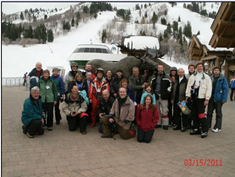
The club went on a trip to Powder Mountain and Snowbasin outside of Ogden, Utah in March. See trip recap on pages 7-8.