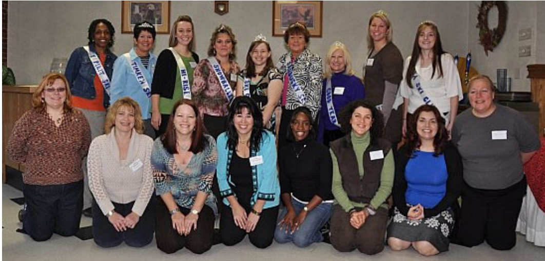
Queens and Committee at Reinecker's

The day started with all nine of the competing Queens meeting the committee at Reinecker's, where the initial interviews would proceed through the afternoon. Each queen was given a 15 minute interview with the panel of judges, and based on these a select five would be chosen.