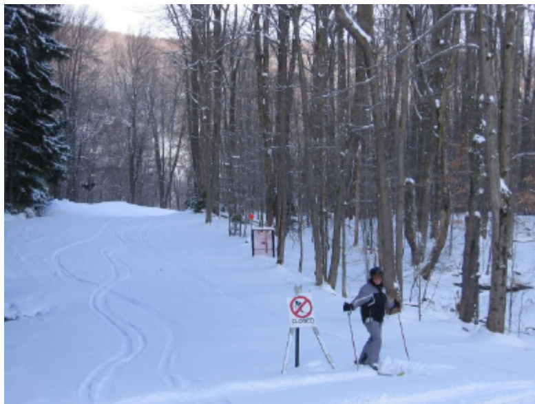
Victoria showed a few of us that the sweetest powder lies on the closed runs.