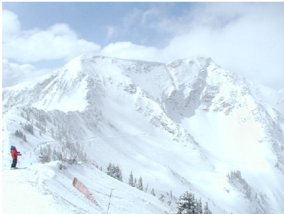
SNOWBIRD, UTAH (Park City Trip - Story on page 8)