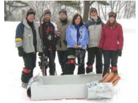
Last year's box sled