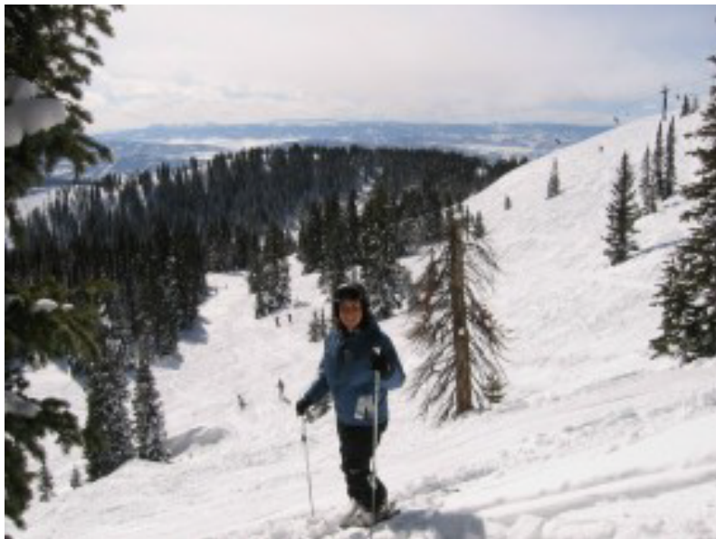
Steamboat Springs, CO