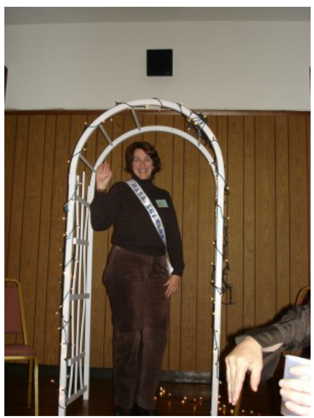
First Runner Up in CMSC Ski Queen Pageant !!!