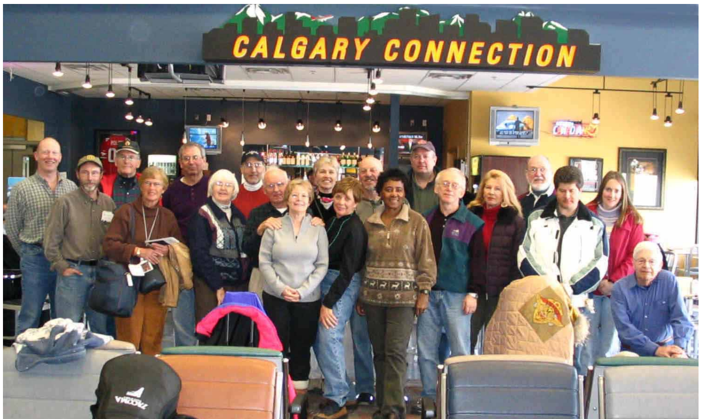
Most of the group at the Calgary airport on the way home.